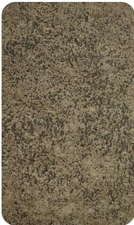
GOLD COAST - 903