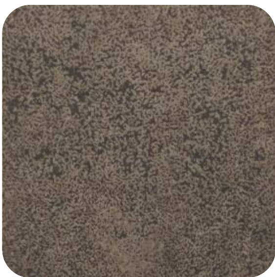
GOLD COAST - 908