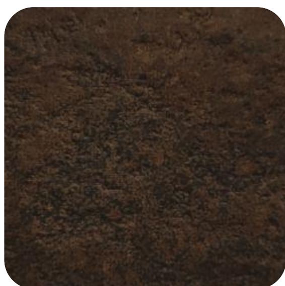
GOLD COAST - 906