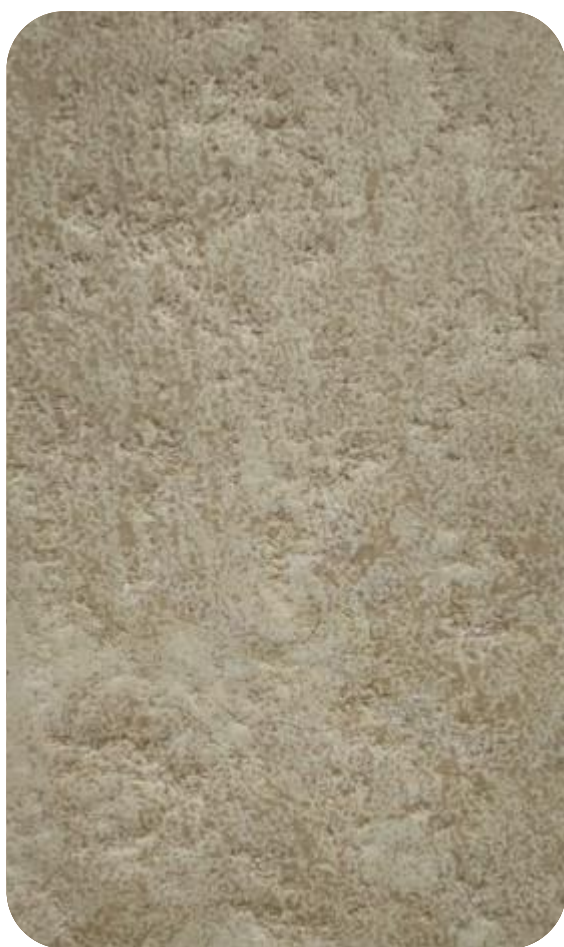
GOLD COAST - 901