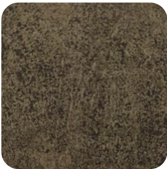
GOLD COAST - 910