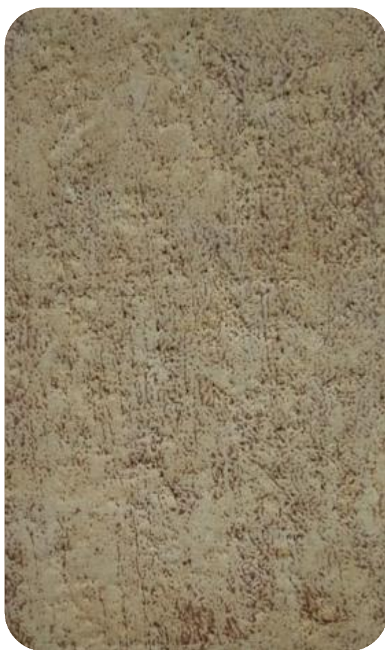
GOLD COAST - 902