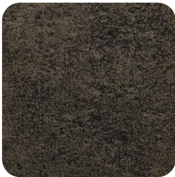
GOLD COAST - 911