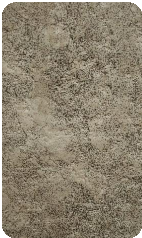
GOLD COAST - 909