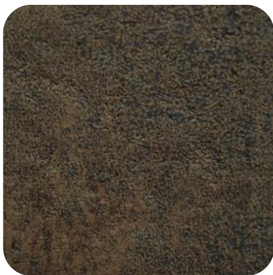
GOLD COAST - 907