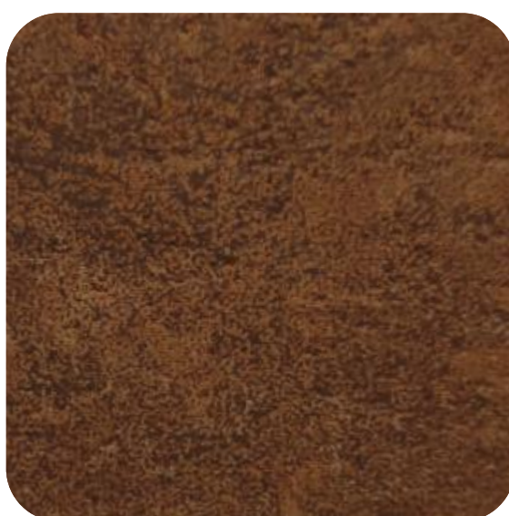
GOLD COAST - 905