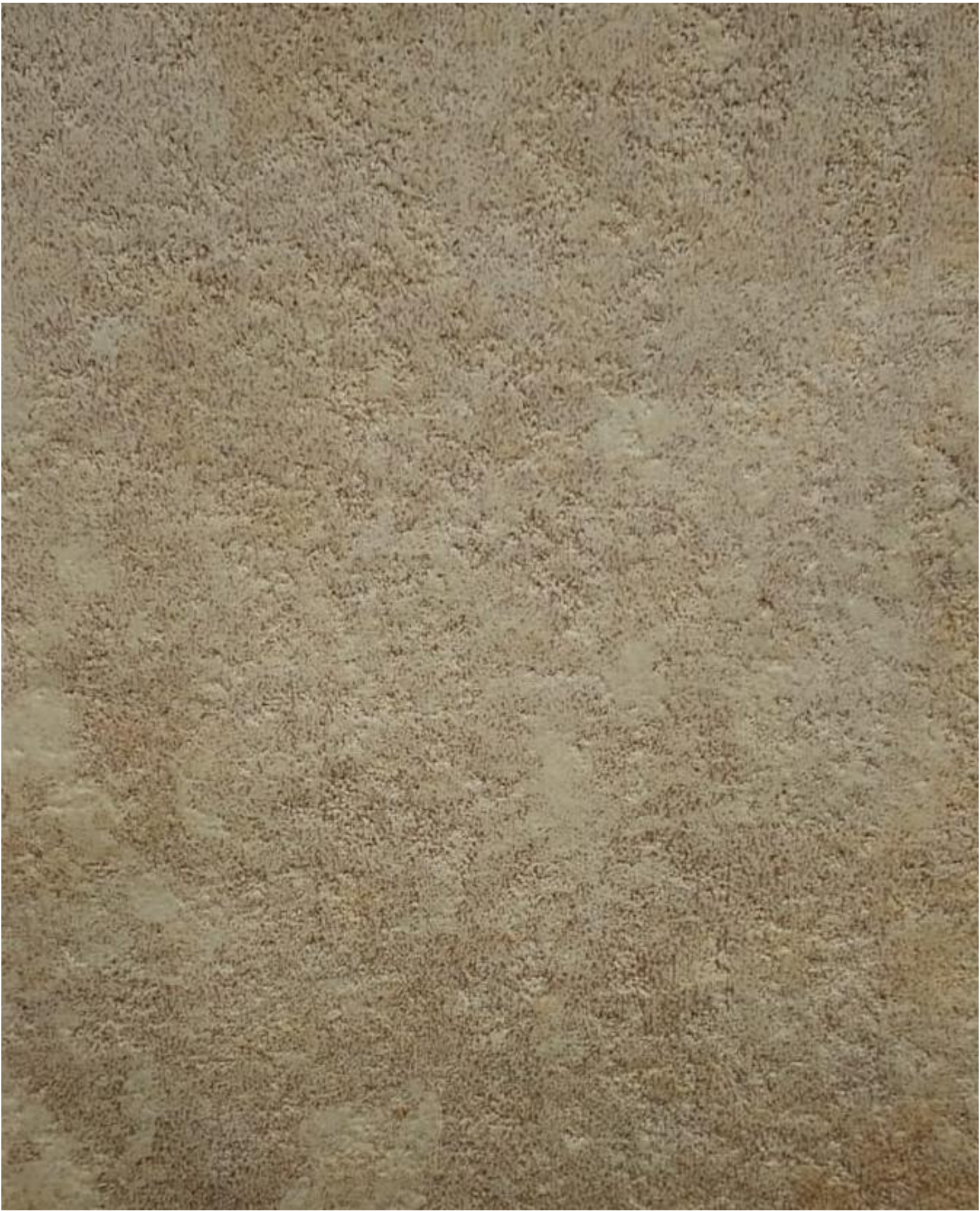
GOLD COAST - 902