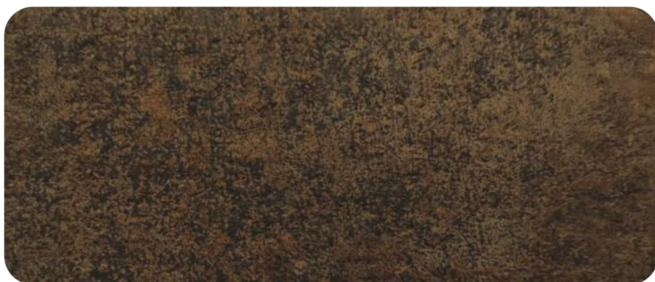
GOLD COAST - 904